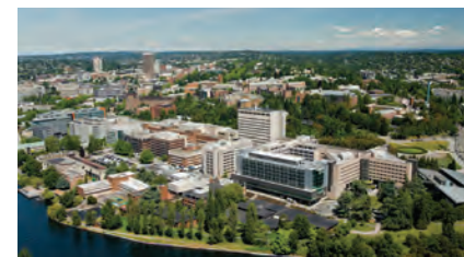
University of Washington Medical Center SEATTLE, WASHINGTON | 432 BEDS & 28 ORS