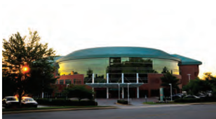
Bon Secours St. Francis Medical Center GREENVILLE, SOUTH CAROLINA 91 BEDS & 12 ORS