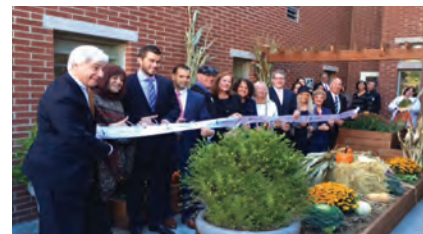
HackensackUMC HACKENSACK, NEW JERSEY | 691 BEDS & 34 ORS