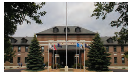
St. Cloud VA Health Care System ST. CLOUD, MINNESOTA 388 BEDS & 3 ORS