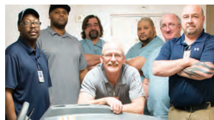
Erie Veterans Affairs Medical Center ERIE, PENNSYLVANIA | 60 BEDS & 3 ORS