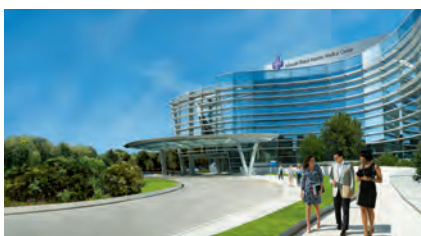
Advocate Illinois Masonic Medical Center CHICAGO, ILLINOIS | 338 BEDS & 18 ORS