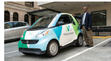
Virginia Mason Seattle Hospital & Medical Center SEATTLE, WASHINGTON | 294 BEDS & 24 ORS