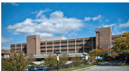
Advocate Good Samaritan Hospital DOWNERS GROVE, ILLINOIS 324 BEDS & 17 ORS