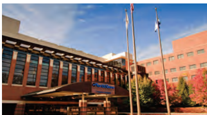
NorthShore University HealthSystem Evanston Hospital EVANSTON, ILLINOIS | 306 BEDS & 20 ORS