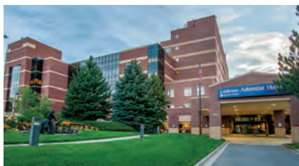
Littleton Adventist Hospital LITTLETON, COLORADO | 201 BEDS & 13 ORS