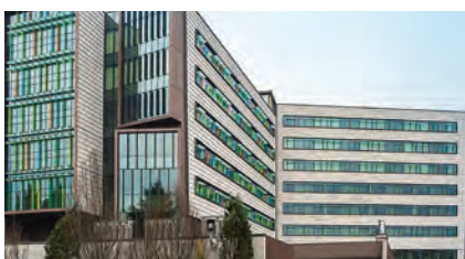
Seattle Children's Hospital SEATTLE, WASHINGTON | 316 BEDS & 14 ORS