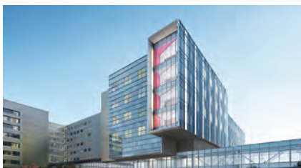
Advocate Christ Medical Center OAK LAWN, ILLINOIS | 659 BEDS & 44 ORS