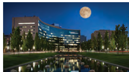
Cleveland Clinic CLEVELAND, OHIO | 1,440 BEDS & 86 ORS