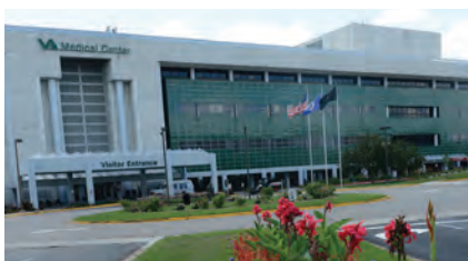
Minneapolis VA Health Care System MINNEAPOLIS, MINNESOTA 350 BEDS & 23 ORS