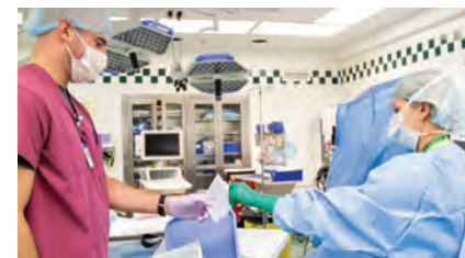
Yale-New Haven Hospital NEW HAVEN, CONNECTICUT 1,572 BEDS & 71 ORS