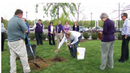
Bon Secours Richmond Health System - St. Mary's Hospital RICHMOND, VIRGINIA | 391 BEDS & 24 ORS