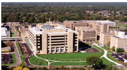
Beaumont Hospital, Royal Oak ROYAL OAK, MICHIGAN | 1,070 BEDS & 47 ORS