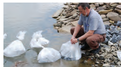
James E. Van Zandt VA Medical Center ALTOONA, PENNSYLVANIA 57 BEDS & 3 ORS/PROCEDURE ROOMS