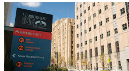
Harborview Medical Center SEATTLE, WASHINGTON | 413 BEDS & 26 ORS