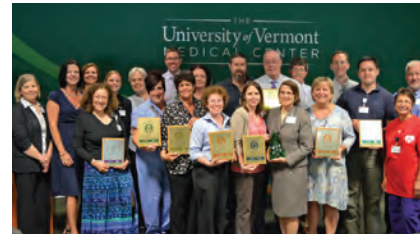
The University of Vermont Medical Center BURLINGTON, VERMONT | 392 BEDS & 22 ORS