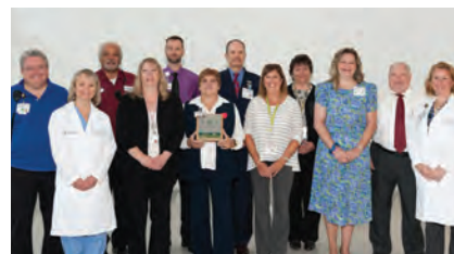
Cleveland Clinic - Marymount Hospital CLEVELAND, OHIO | 170 BEDS & 14 ORS