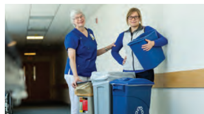
Dartmouth-Hitchcock Medical Center LEBANON, NEW HAMPSHIRE 417 BEDS & 36 ORS