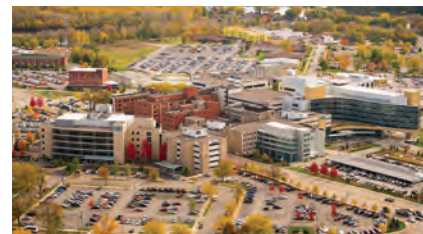
Gundersen Health System LA CROSSE, WISCONSIN | 268 BEDS & 35 ORS