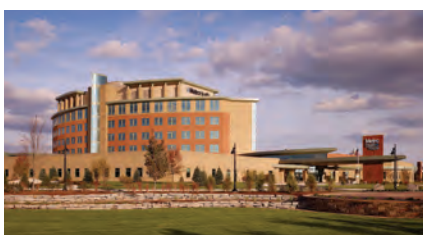
Metro Health Hospital WYOMING, MICHIGAN | 208 BEDS & 10 ORS