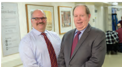
Memorial Sloan Kettering Cancer Center NEW YORK, NEW YORK | 473 BEDS & 28 ORS