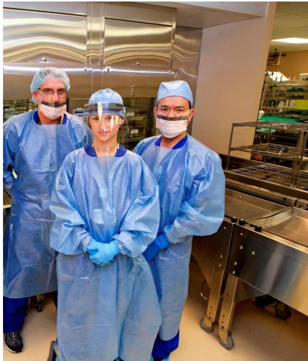
The SPD team on the decontamination side.