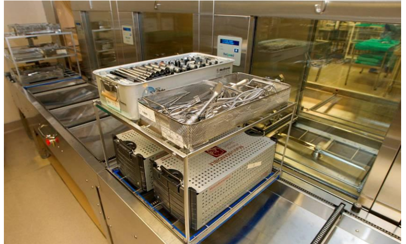
Clean, dry instruments make their way down the Belimed automated conveyor system.