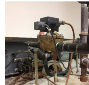
S-16 Leaking Valve