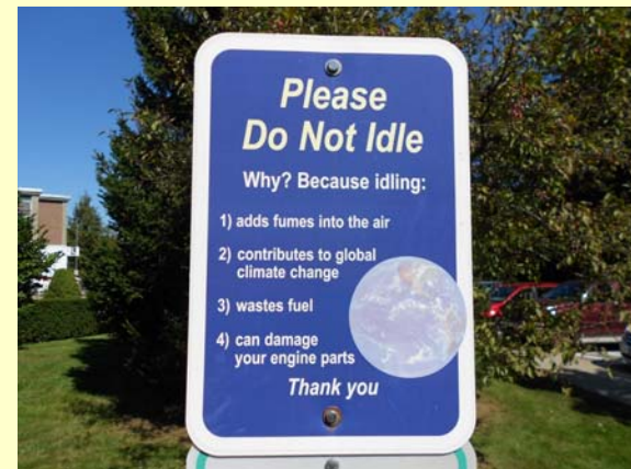
Brattleboro Memorial Hospital, Brattleboro, VT